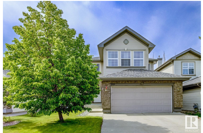
2591 Hanna Crescent NW