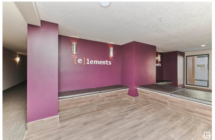
216-340 Windermere Rd NW, Edmonton, AB